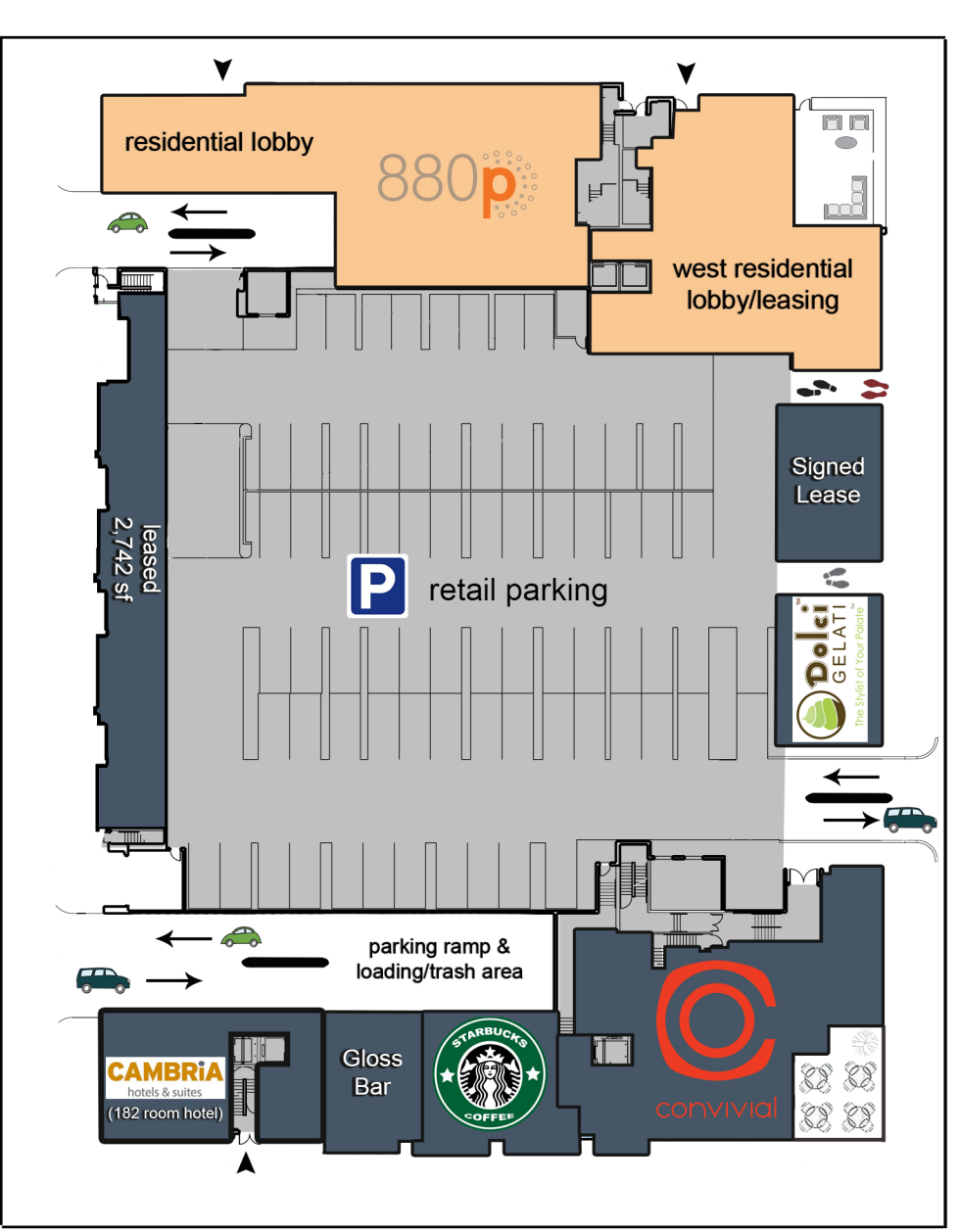
8th street, nw